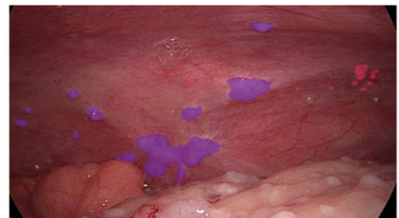
Figure 2: Image with analysis chart.